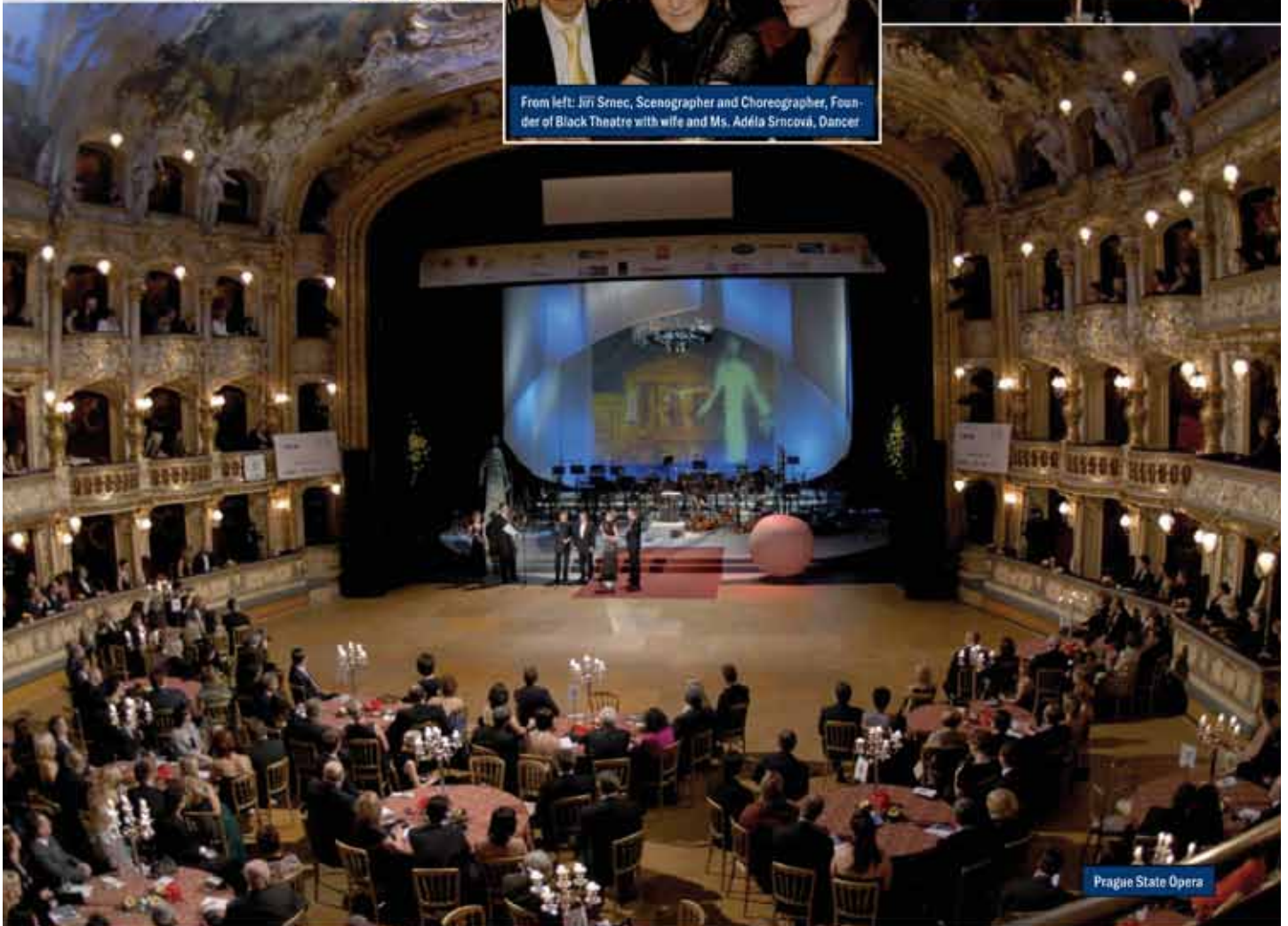
Prague State Opera